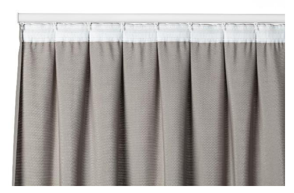
Front and reverse side of a typical pleated curtain

Alternatively, the Silent Gliss Swiss Pleat uses gliders sewn into the curtain, that fit in the track to deliver a unique, delicate, and understated curtain aligned with more traditional curtain design. Learn more about Swiss Pleat.