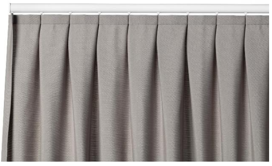
Silent Gliss Swiss Pleat reverse view