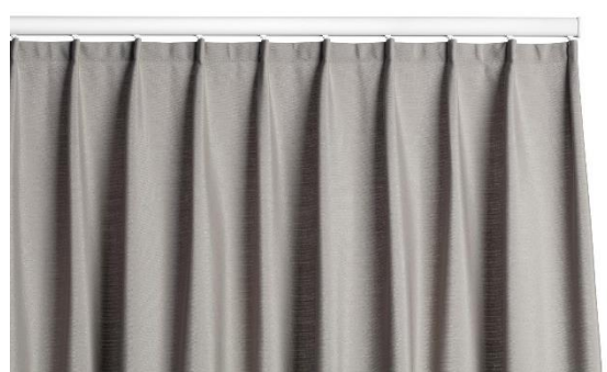
Silent Gliss Swiss Pleat front view