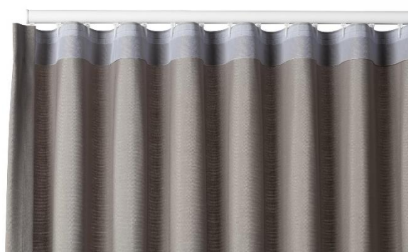
Silent Gliss Wave reverse view

Wave is offered with different hook and glider spacing to deliver either a soft, flatter design, or deep undulating curves.