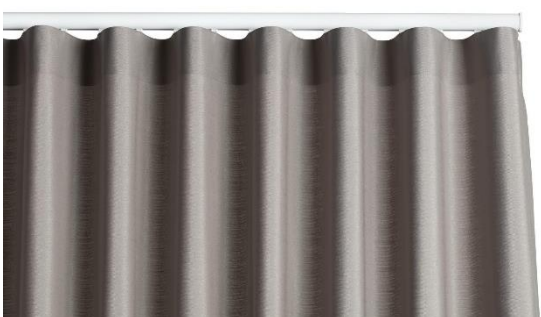
Silent Gliss Wave front view